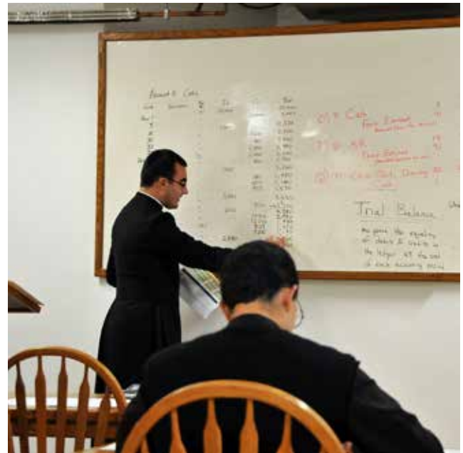
Brother Theresian instructs the brothers in accounting principles.

The brothers also take classes on Holy Scripture,