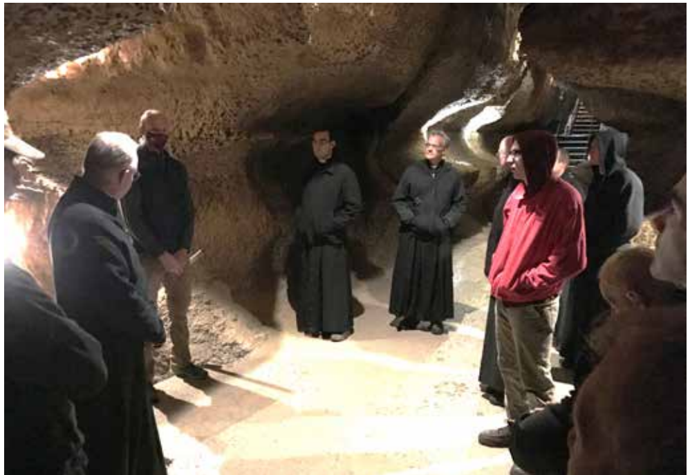
The brothers enjoyed exploring in the Niagara Cave.