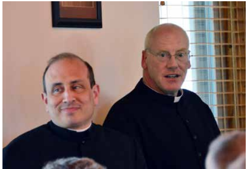
Two of our brothers celebrated the 25th anniversary of their vows.