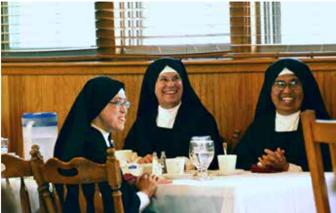
Sisters from Browerville joined in the celebration.