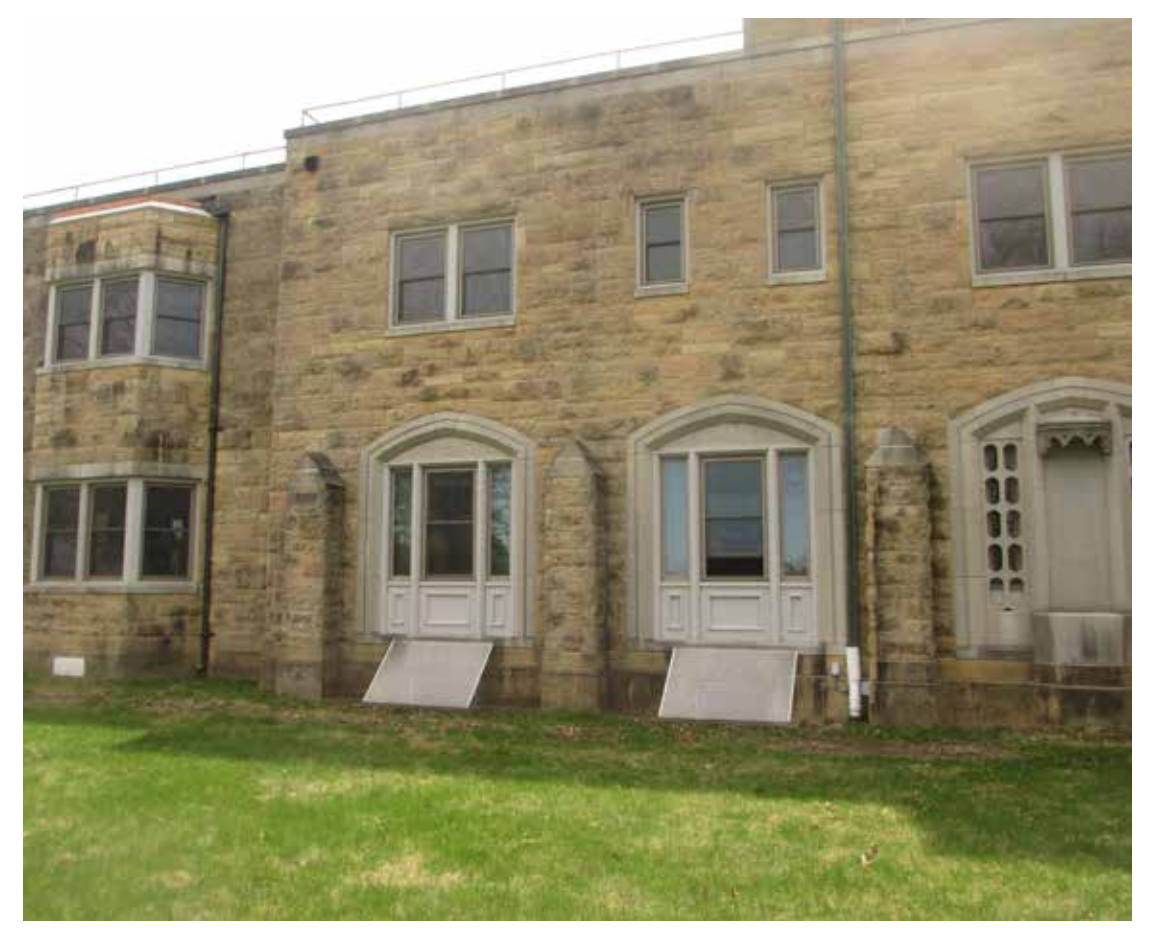
Building Sandstone Discoloration.