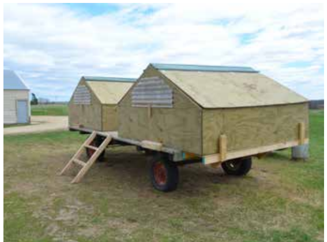
New chicken brooders constructed by the brothers over the winter for young chicks