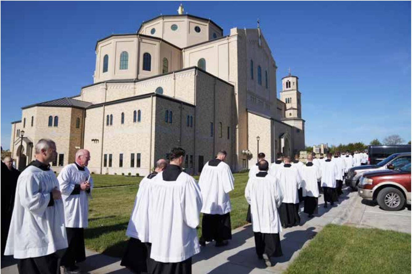
Visit of Brothers and Priests to St. Marys KS., for the Consecration of the new church.