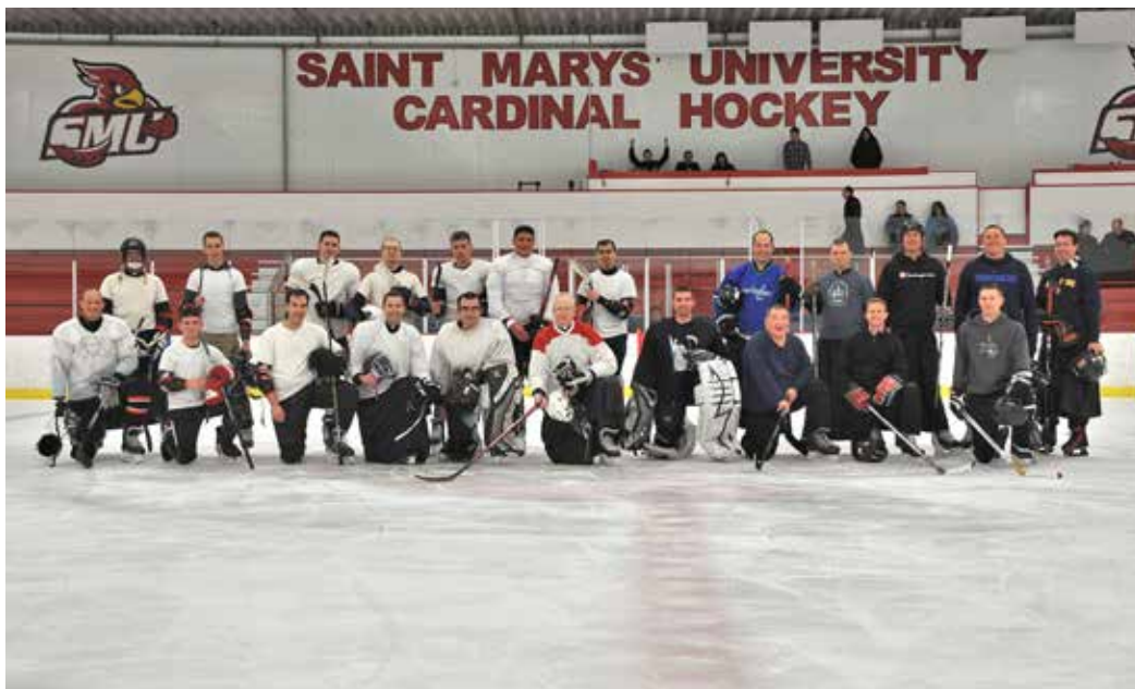
Brothers vs Priests hockey game (Brothers won by one).