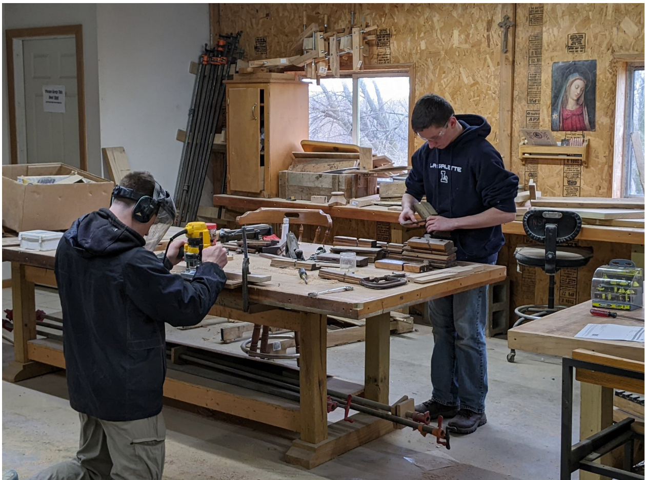
Two seminarians work in the woodshop